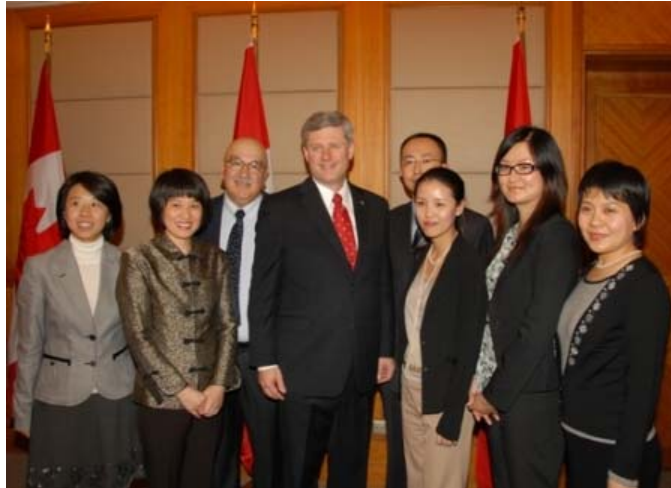
ACO staff with Prime Minister Harper

Prime Minister Harper had a busy schedule during his first official visit to China. Minister of International Trade, the Honourable Stockwell Day, and Minister of Agriculture, the Honourable Gerry Ritz accompanied the Prime Minister. The delegation visited Beijing, Shanghai and Hong Kong.