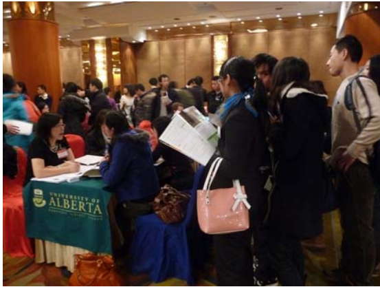
U of A at PHD workshop